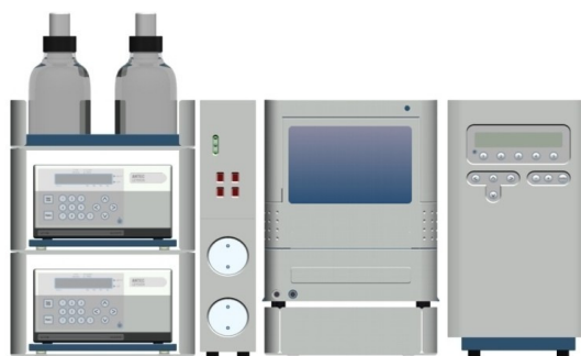
Fig. 1. ALEXYS Aminoglycosides analyzer for Spectinomycin.

The ALEXYS® 'Aminoglycosides analyzer' is a dedicated LC solution for the analysis of Spectinomycin, which matches the EP requirements for peak resolution and repeatability of the principal peak. The European Pharmacopoeia, 6.0, (2008), 2947-2949 was used as a basis to set-up this method. In this application note typical results obtained with the Aminoglycosides analyzer are reported demonstrating its performance for the analysis of impurities in Spectinomycin bulk drugs.